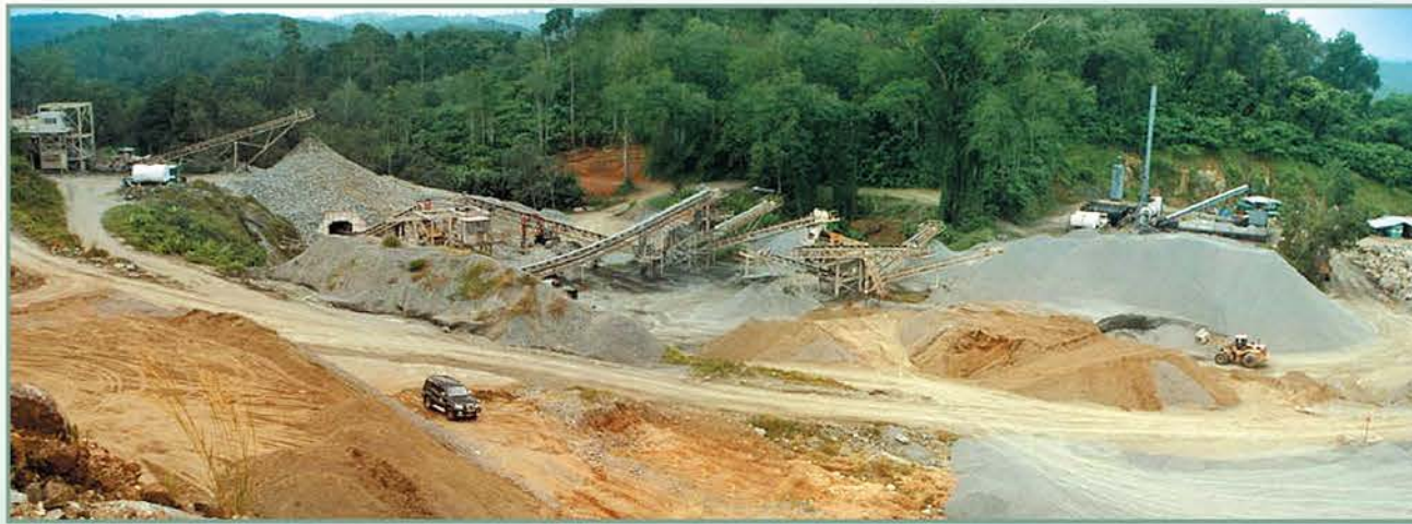
• Quarry plant in Benta, Pahang.