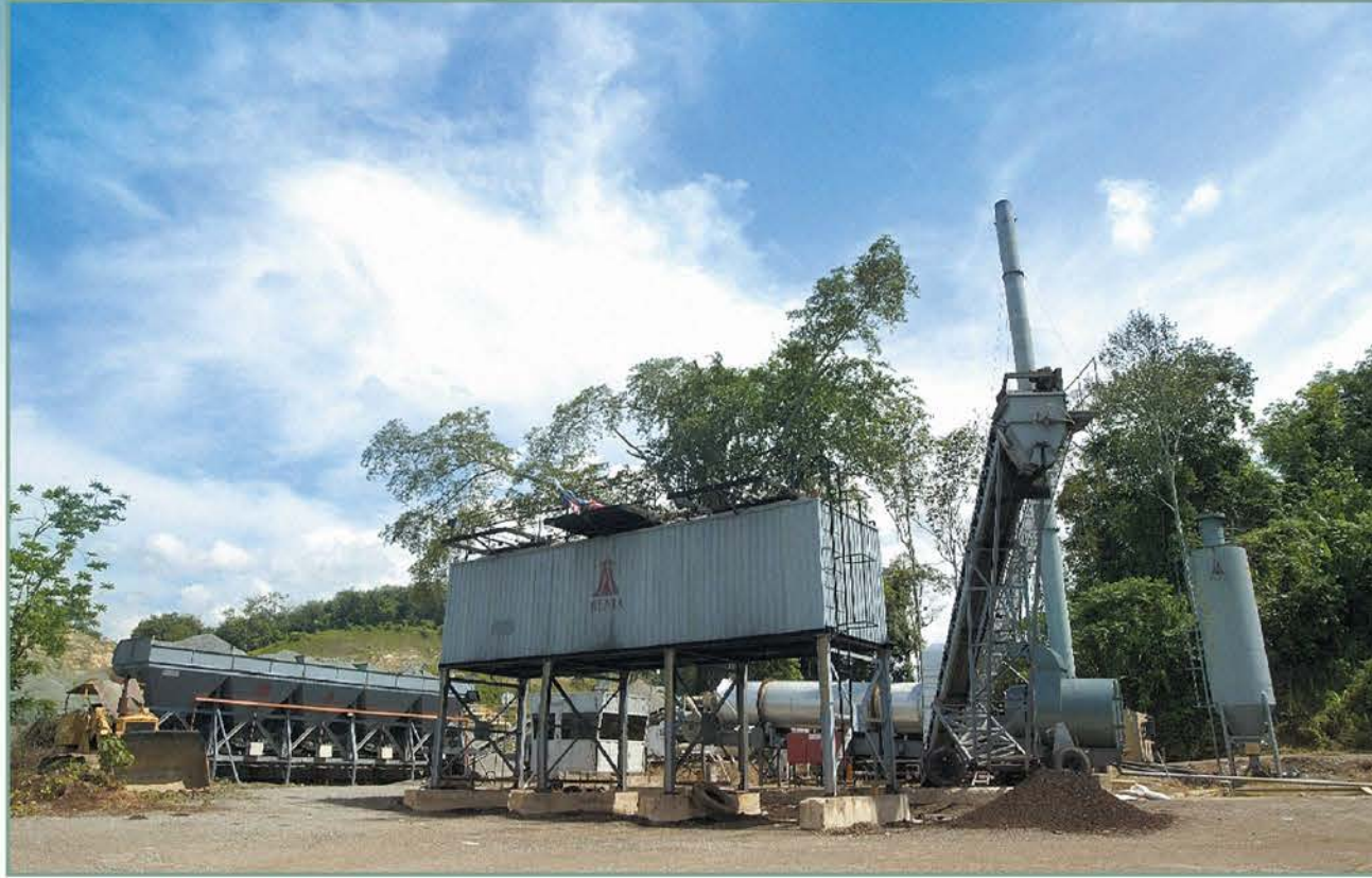
• Premix plant in Benta, Pahang.